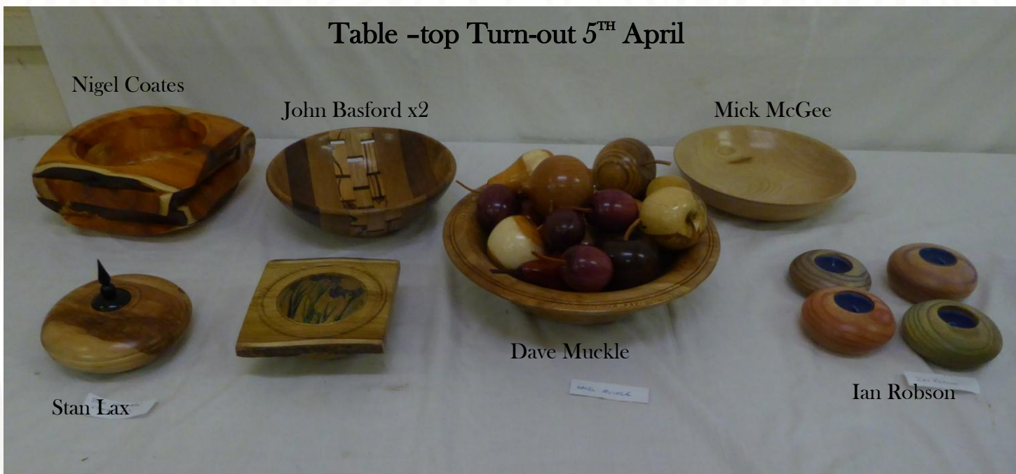
Table -top Turn-out 5 TH April