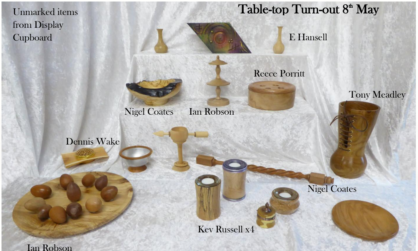
Table-top Turn-out 8 th May